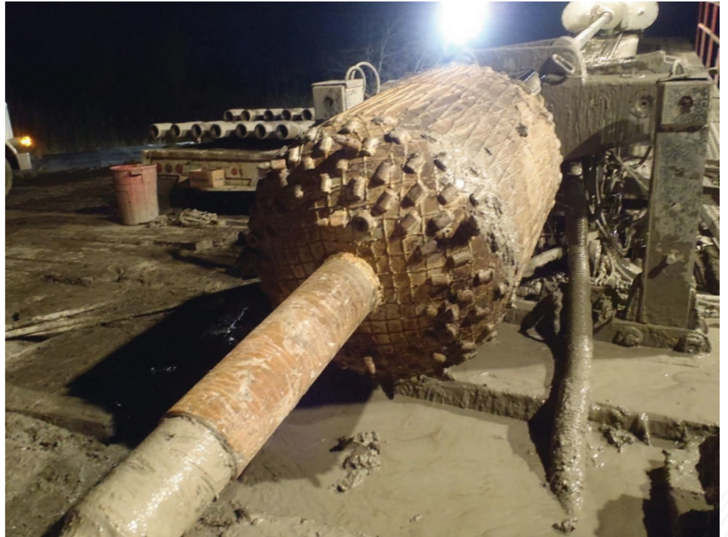
Barrel reamer used for swab passes.

These types of tools are not typically used in rock installations because they lack the ability of break up rock fragments that may have accumulated in the hole.