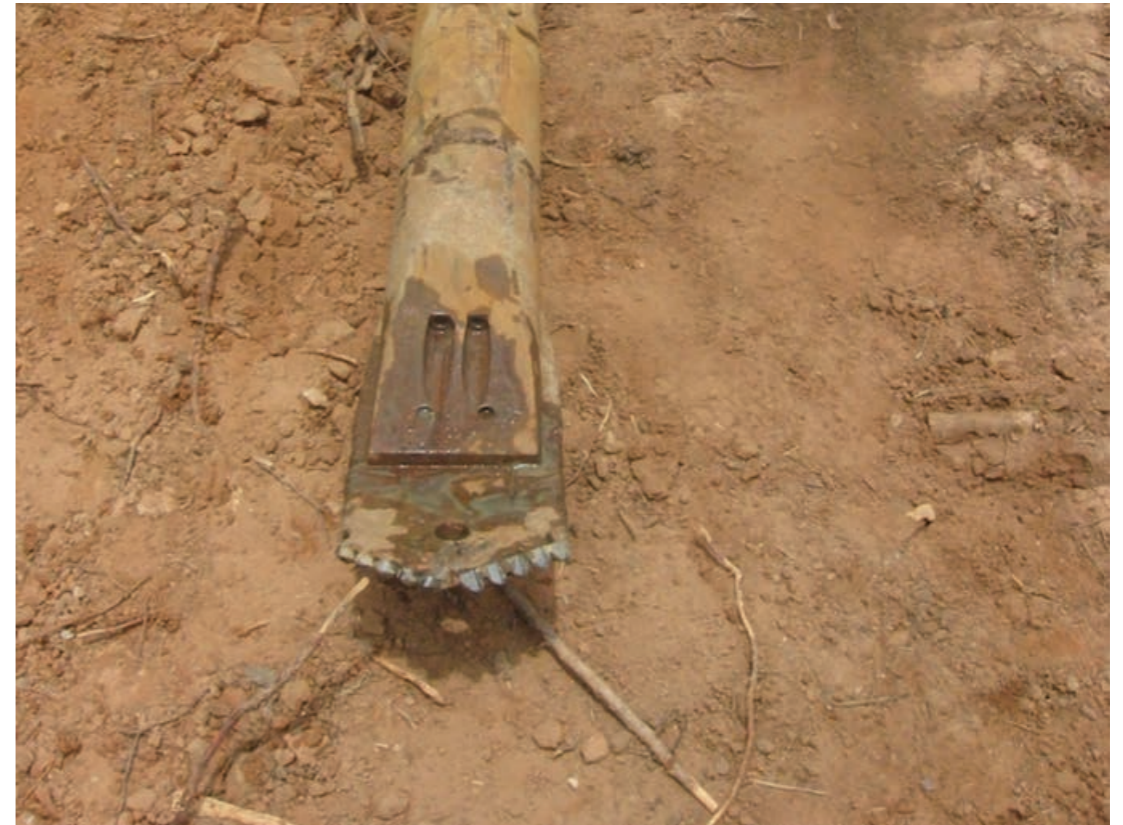
A duckbill style drill bit used for soil formations.

Drill bits used for the pilot hole are typically of two different styles. The most common drill bit used for larger installations are tri-cone drill bits like those used in many other forms of downhole drilling. Tri-cone drill bits can be used in any soil formation with a jetting assembly or in rock formations in conjunction with a mud motor. The cutters on the bit come in many different styles appropriate for different drilling conditions. When used in rock, the hours on the bit should be recorded.