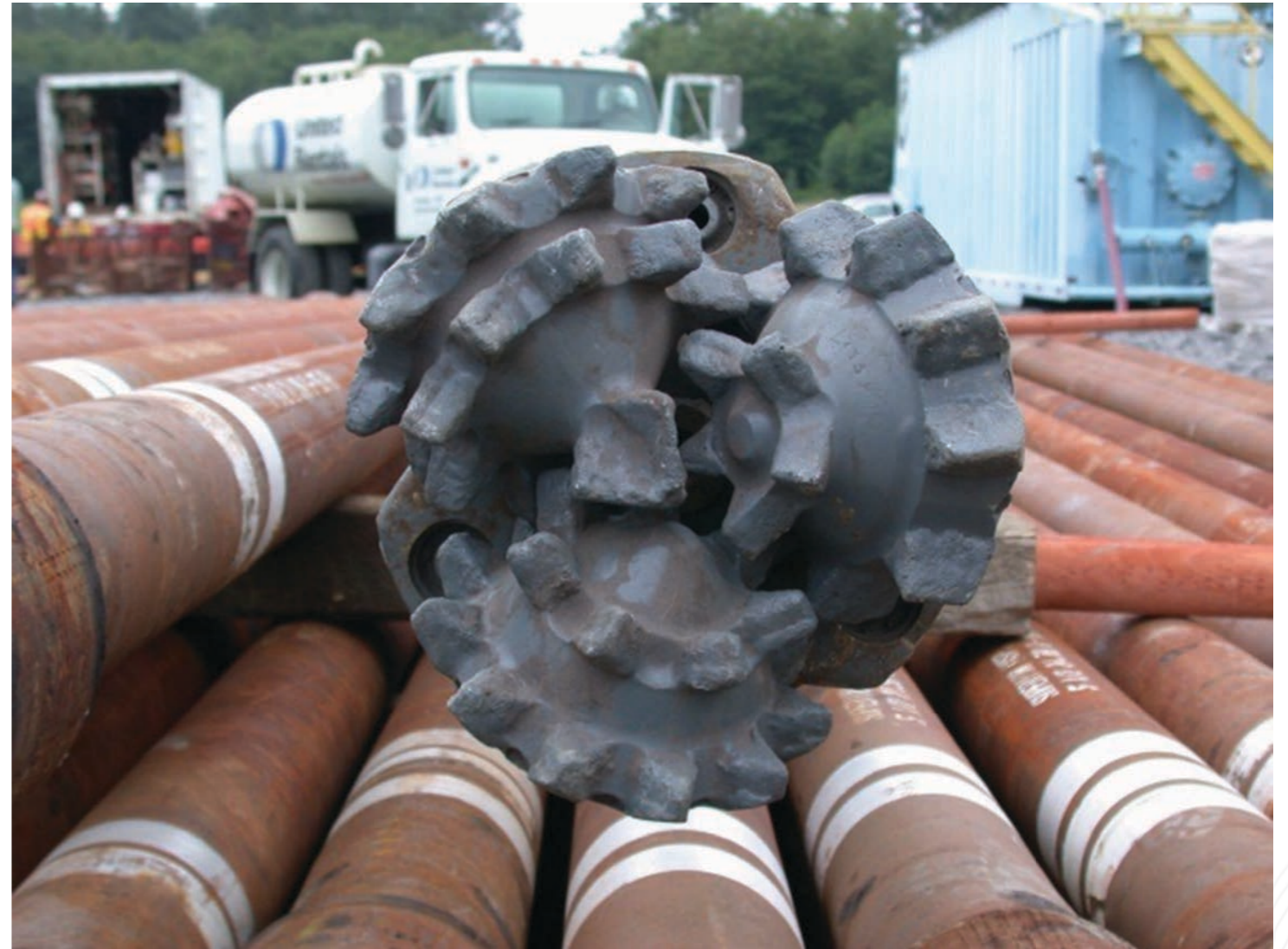
A milled-tooth tri-cone drill bit for soil and soft rock formations. Notice the white bands on the joints of drill pipe. They indicate that they have been inspected.

The jets can be individually plugged prior to use in order to direct more drilling fluid in a preferred direction. This can help with steering corrections during pilot hole operations.