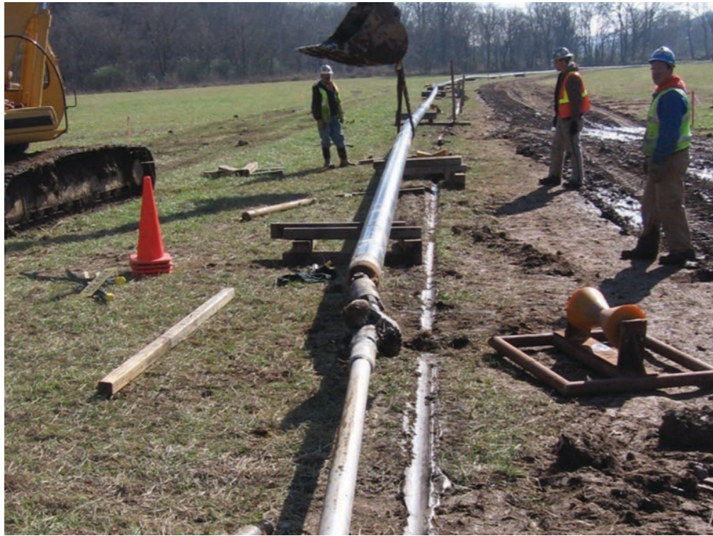
A 10-inch xylene pipeline in Tennessee.