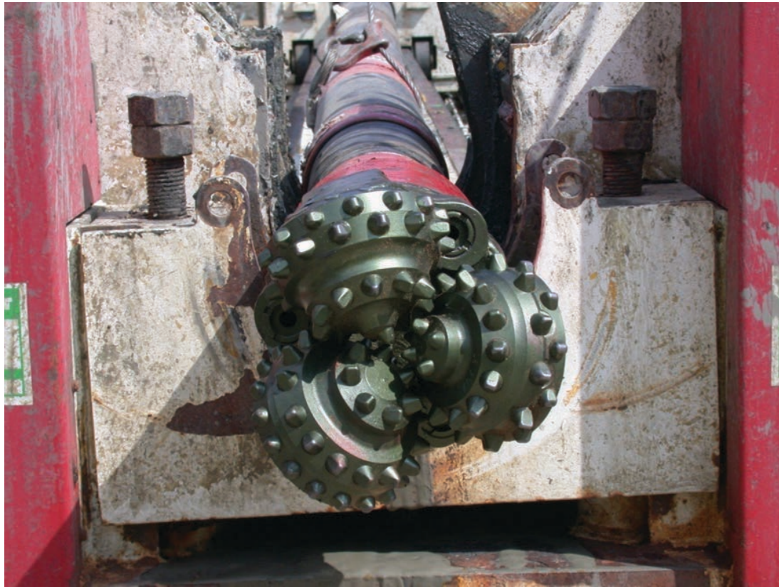
A tungsten carbide insert (TCI) tri-cone drill bit for medium hard rock formations.