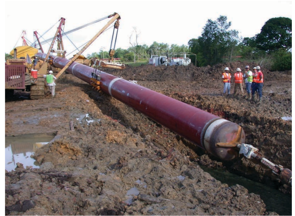
A 56-inch gas pipeline in Trinidad.

The size of a drill rig required for a particular project will depend on several factors. The length and diameter of the pipeline installation will have the largest affect on the required installation force. Large diameter installations can require very high pull forces if buoyancy control is not utilized during pullback. When analyzing the estimated installation forces, several buoyancy conditions should be evaluated using different drilling fluid weights downhole and with and without buoyancy control during pullback, so a suitably sized drill rig can be selected.