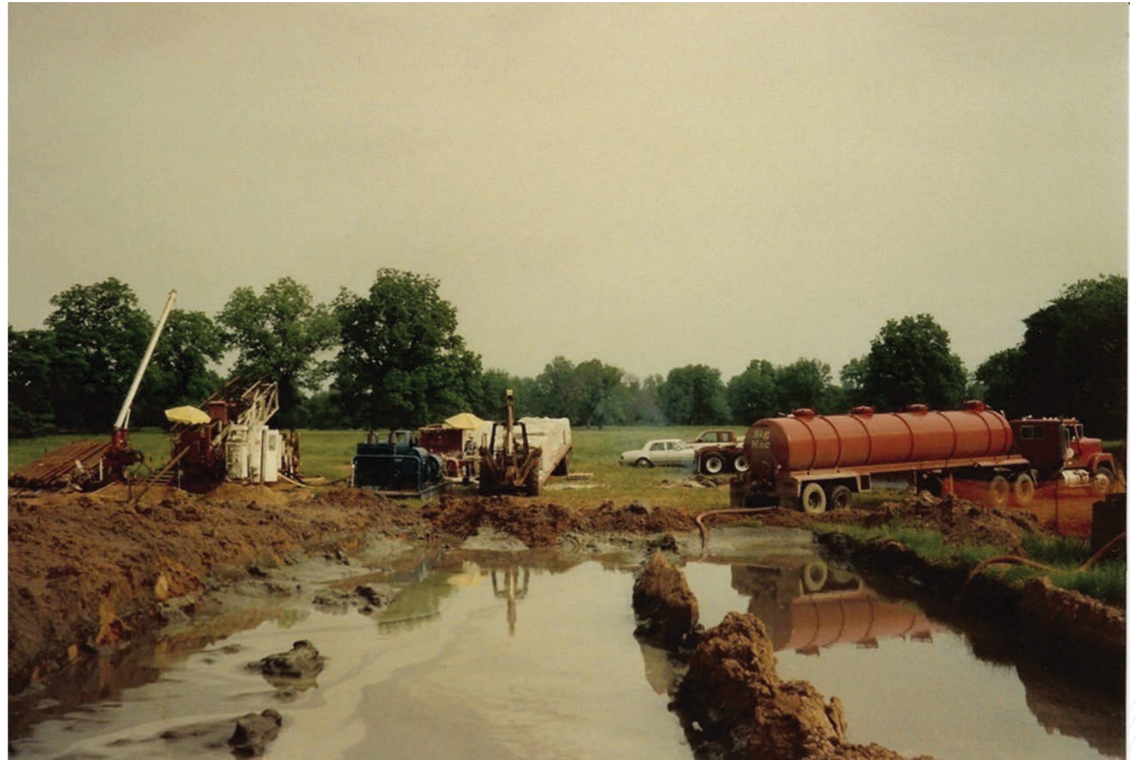
Drilling fluid and cuttings contained in large open pits.

When planning a project, the disposal of the drilling fluid and cuttings needs to be considered. An efficient drilling fluid recycling system can greatly reduce the volume of drilling fluid that has to be disposed of.