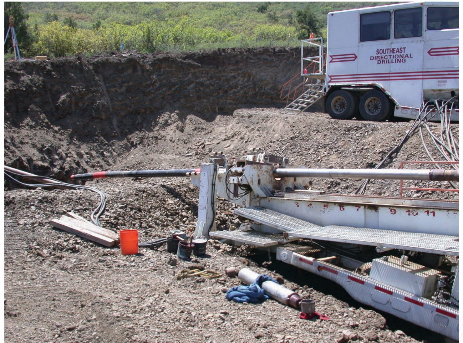
A Bottom Hole Assembly with a positive displacement mud motor.

The downhole steering probe is located in the monel behind the mud motor. When using a mud motor, the length of the mud motor creates a larger distance between the drill bit and the steering probe. This distance is typically greater than 20 feet. This distance makes it more difficult for the pilot hole surveyor to see the effects of steering corrections over short drilled distances as opposed to when using jetting assemblies.