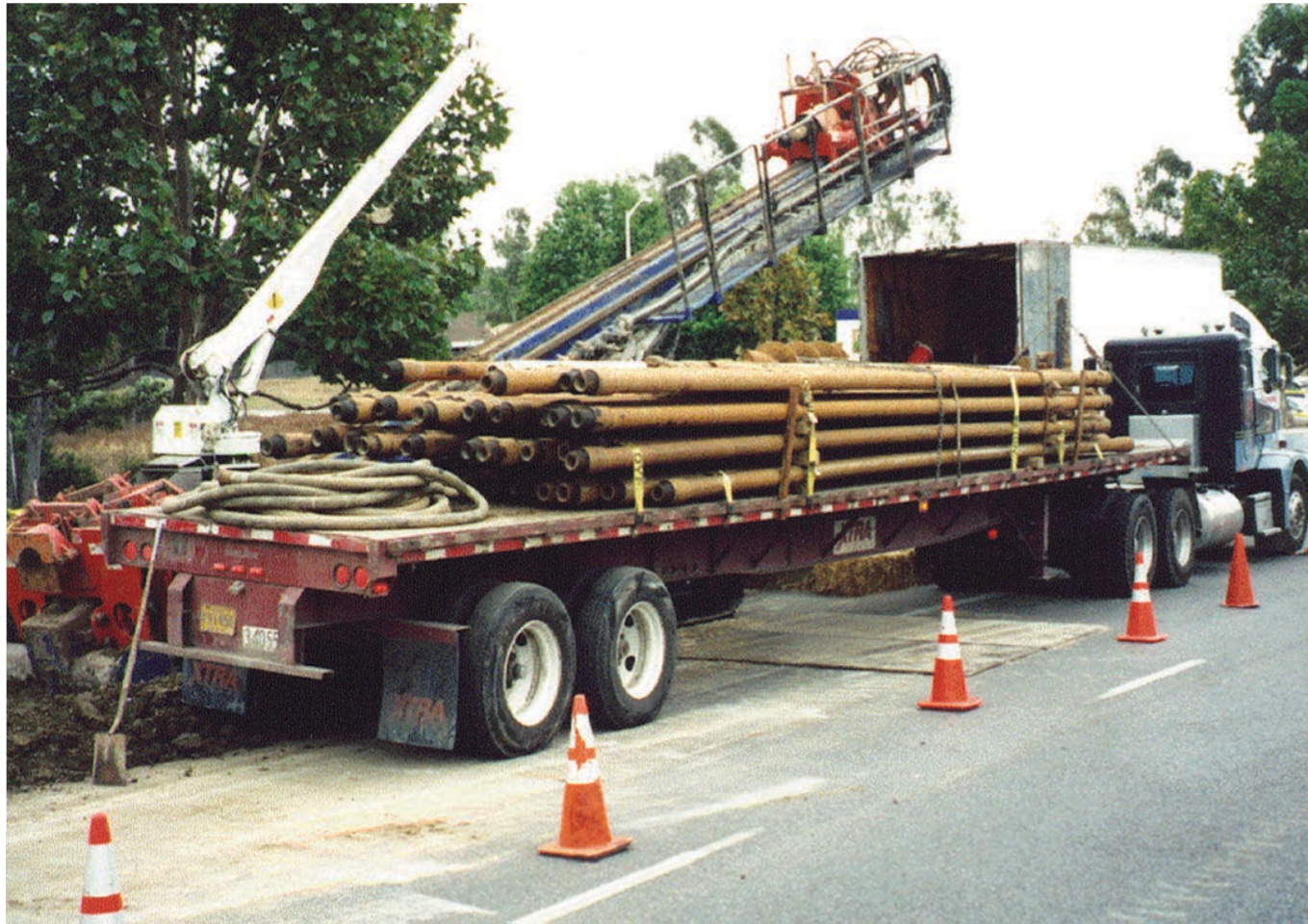
Joints of Range 2 drill pipes (~31 feet long)

The drill pipe joints used for HDD vary in length, and depend on the size of the drill rig they will be used with. The most common joint lengths are 10, 15, 20 and 31 feet. Drill pipe is a critical component of the downhole tooling because it is subjected to substantial wear and tear during drilling operations. The threaded tool joint connections at each end are most prone for wear and tear. The tube section of each joint is also prone for wear, especially in rock installations and crossings with significant gravel content.